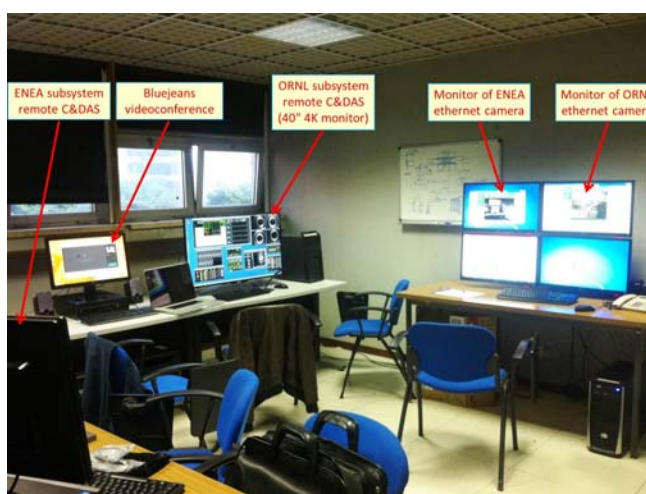
Figure 3. The remote control station at ENEA Frascati

Remote operation capability via Ethernet is a further distinctive feature of this injector. With computer security recently given higher priority than ever at ORNL, getting remote access to local computer has been really challenging. A remote control station has been set up at ENEA Frascati (figure 3), consisting of